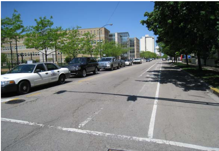
Wells Street Before