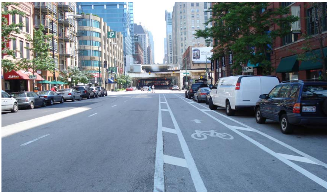
Rendering of the Wells Street Buffered Bike Lane