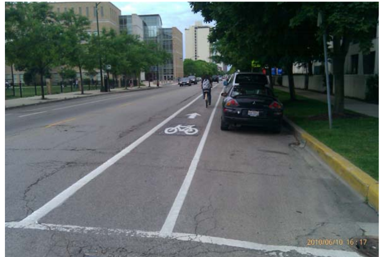
Wells Street After